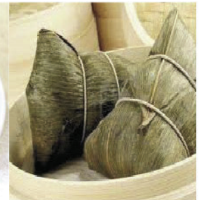
Wrapped Rice w/雙 assorted meat 1 pcs 鹹肉粽子 $ 5.95