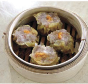
Pork Sui-My 燒賣 $ 6.95