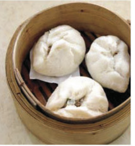
Chicken Buns 雞包 $ 6.50