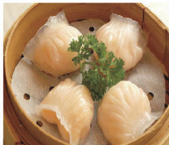
Shrimp Dumpling 蝦餃 $ 6.95