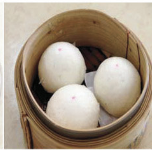
Cream Buns 奶皇包 $ 6.95