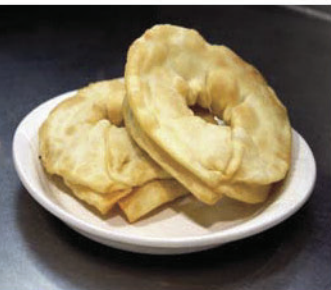
Green onion cake 蔥油餅 $ 6.95 For 2 Pieces