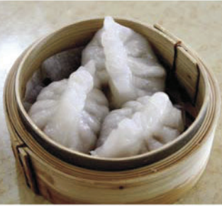
Shrimp & Peanut Dumpling 潮州粉果 $ 6.95