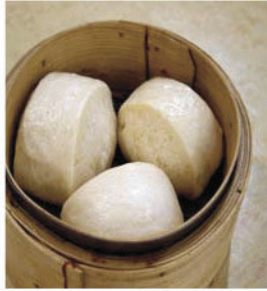
Steamed Buns 饅頭 $ 5.50