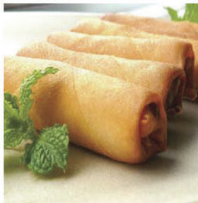
Vietnamese Spring roll (4pcs) 越南春捲 $ 6.95