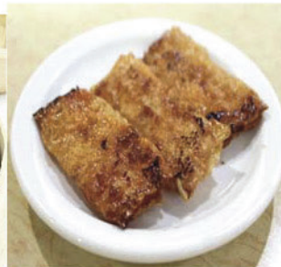
Shrimp Bean curd Rolls 蝦腐皮卷 $ 7.95