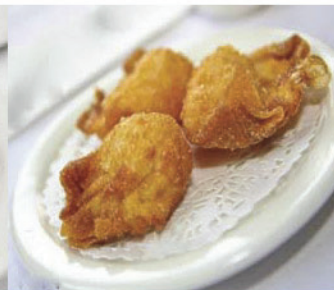
Fried Shrimp Dumplings (4pcs) 龍蝦角 $ 7.95