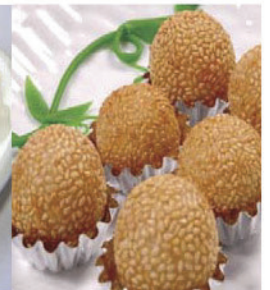
Red bean Sesame Balls (4 pcs) 芝麻球 $ 6.95