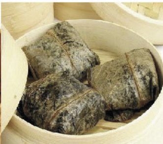
Sticky rice 2 pcs 珍珠雞 $ 6.95