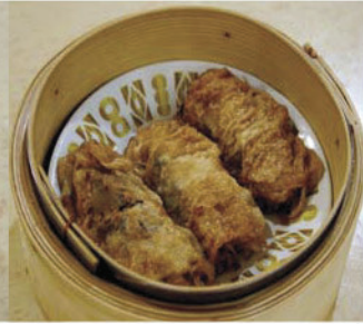
Vegetarian Bean Curd Rolls 腐皮卷 $ 6.95