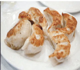
Pan Fried Pork Dumplings (6pcs) 菜肉鍋貼 $ 6.95