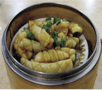
Curry Squid 咖哩魷魚 $ 6.95