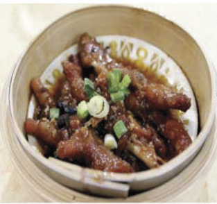
Chicken feet w/ Black Bean Sauce 鳳爪 $ 6.95