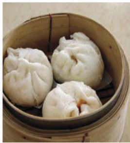
BBQ Pork Buns 叉燒包 $ 6.95